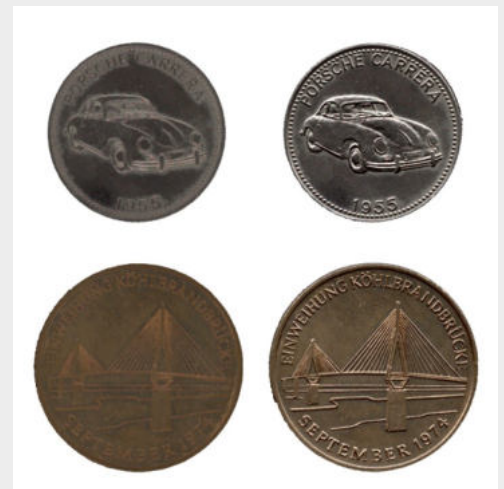
2D scan versus 3D scan, capture all details