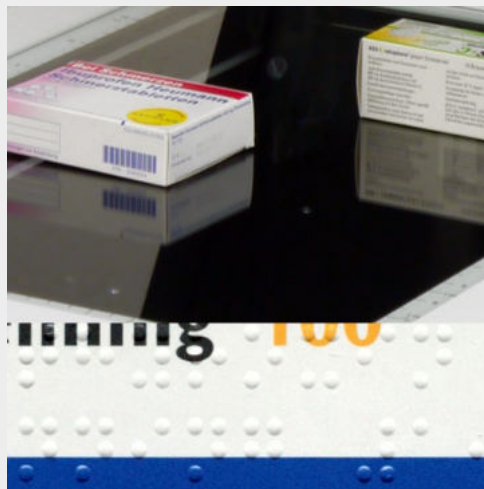
Quality control of print and braille on cardboard