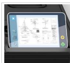
Control the entire scan process from the IQ FLEX built-in touchscreen computer