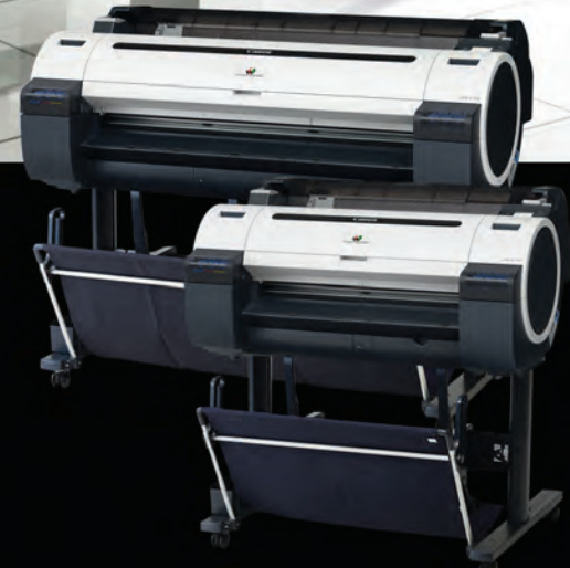
iPF670 shown with stand

Affordable printers for those looking for an entry-level, multipurpose, large-format printer.