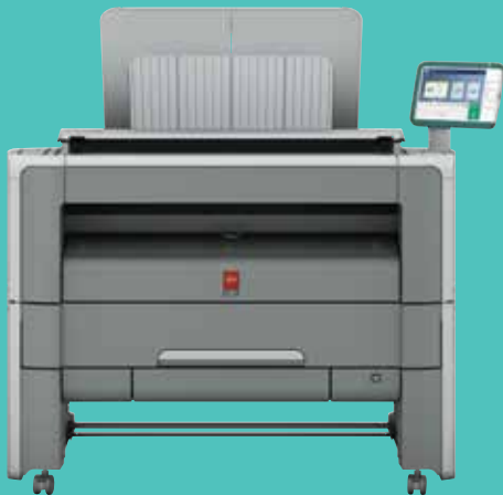
WITH OPTIONAL SCANNER EXPRESS II

You can access your projects' documents directly at the printer using the Océ ClearConnect multi-touch user panel. Are your files on a USB stick, on a network location or in the cloud? Just browse and swipe to your files and print them. In addition, you can scan directly to virtually unlimited destinations in the cloud or your Intranet. When you have a file on your iPad® mobile device, just use the WiFi infrastructure of your company to access the Océ PlotWave 340/360 printer and print via the Océ Publisher Mobile app. Or print from your desktop PC via Océ Publisher Select™ software to manage more complex document sets.