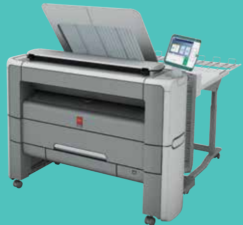
WITH OPTIONAL REAR DELIVERY TRAY