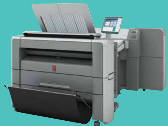
WITH OPTIONAL OCÉ ESTEFOLD 4312 FOLDER AND EXTENDED STACKER