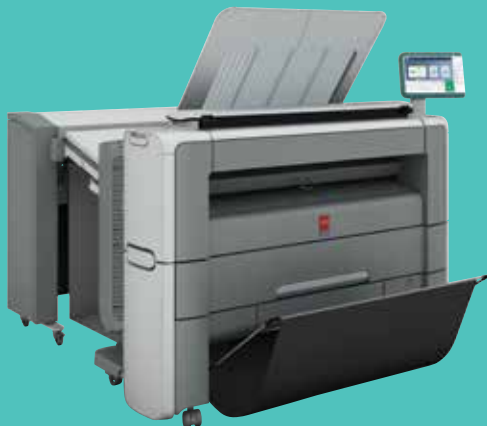
WITH OPTIONAL OCÉ ESTEFOLD 2400 FANFOLD